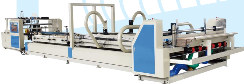
Automatic Folder & Gluer