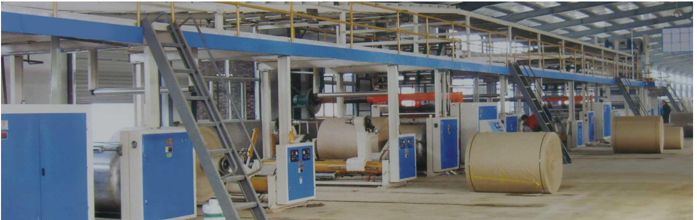
Automatic 3Ply & 5Ply Board Making Plant