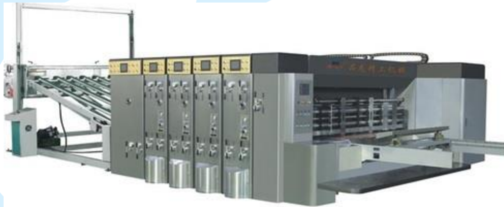
Multi-colour Printing and slotting